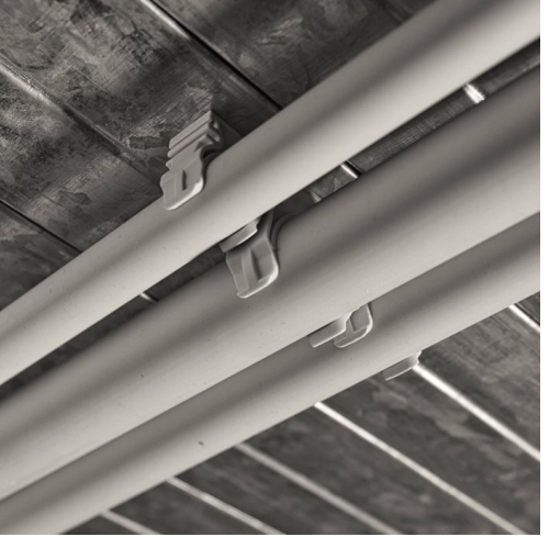
Without the need for further screws, several Basic Clips BC of different sizes can be connected by simply inserting or latching. Mounting time and costs are saved.